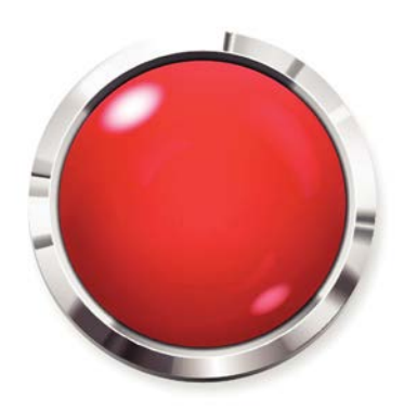
HAL: Dave, this conversation can serve no purpose anymore. Goodbye.